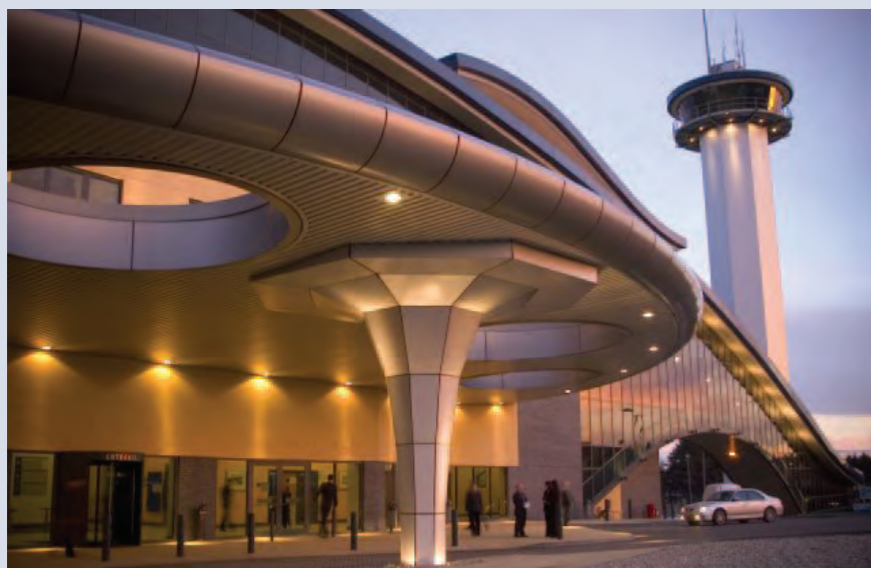
Aberdeen Exhibition and Conference Centre

Friday 22 March 2013 is a date for your diary. A symposium will take place at the impressive Aberdeen Exhibition and Conference Centre. It is an event with something for everyone in the team and two parallel programmes will run.